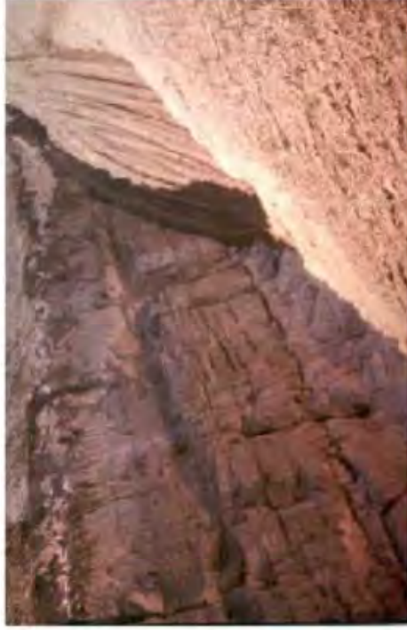
Teton Dam Core Trench and Foundation, Idaho, USA from USBR

Hyatt Tech Center Denver, Colorado May 16-17, 2013