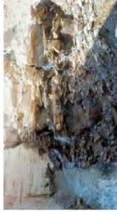
Fontenelle Dam Incident, Wyoming, USA

Hyatt Tech Center Denver, Colorado May 16-17, 2013